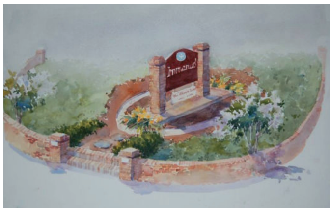
Artist's rendering of proposed sign, welcome wall and garden. Artwork by Patti Bartol.